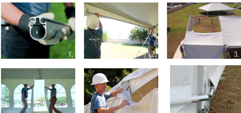
1. Jumbotrac<sup>®</sup> Lite rafter beam section 2. Sidewall rail sliders allow for the use of the same sliding keder sidewall used in the Jumbotrac<sup>®</sup> System 3. Slide-in tops means no more lacing 4. Walls slide like a shower curtain 5. Double valance option for easily connecting gutters and traditional sidewalls. 6. Wall tension system