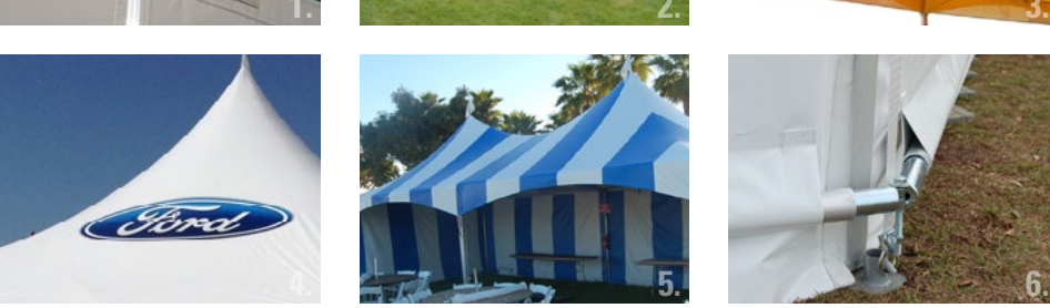
1. Festival® 20x20's with integrated kedered legs and kedered sidewall 2. One of the only high peak designs offered in an expandable version 3. Flying mast design eliminates traditional rafter hardware 4. Perfect solution for branding with graphics 5. Offered in solid colors as well as stripes. 6. Wall tension system option when utilized with keder sidewalls.

CALL US TODAY 800.228.3687 · AZTECTENTS.COM