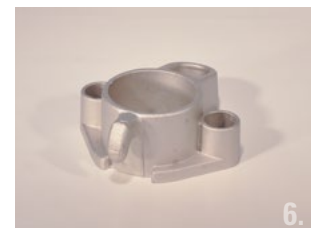
1. Festival® CAN-T Frame Tent with window sidewall 2. Self tensioning wall cables allow walls to slide like a shower curtain 3. Festival® CAN-T cast aluminum corner 4. Perfect solution for branding with graphics 5. Offered in solid colors as well as stripes. 6. Festival® CAN-T cast aluminum baseplate