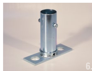
1. Festival® CAN-W walls with tensioning cable 2. Festival® CAN-W Panorama window walls 3. Festival® CAN-W zinc plated steel corner fitting 4. Perfect solution for branding with graphics 5. Offered in solid colors as well as stripes. 6. Festival® CAN-W zinc plated steel base plate