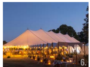
1. Solid sidewall panels 2. The nautical flair, graceful patterning, and artistic reinforcements make the Tidewater® a perfect wedding tent 3. Flags and flagpoles allow for full rotation and a touch of whimsy 4. Clear walls with optional roll-up pocket 5. With the simple shape all you need is simple string or perimeter lighting to create the perfect atmosphere 6. "Wave" entry marquees, door panels, and gutters are available to connect to other tents